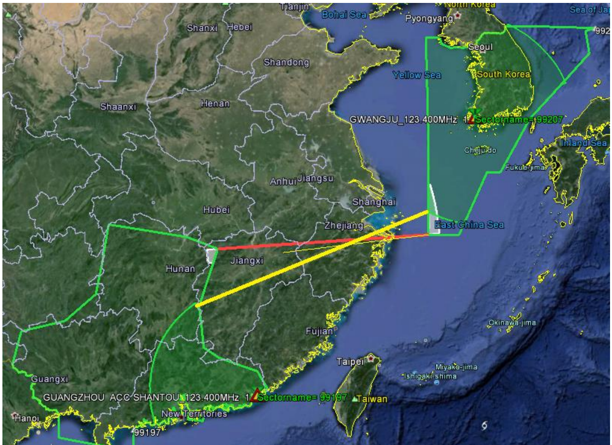
Figure 3 – Interference areas as calculated for polygons for the FIS and ACC services

The red line in Figure 3 connects the closest points between the FIR areas and, when aircraft are operating at the same time at (or near) these closest points, co-frequency interference is predicted. However, the respective aircraft operate in this case outside the coverage of the respective ground stations which implies that in practice in this situation no interference is experienced.